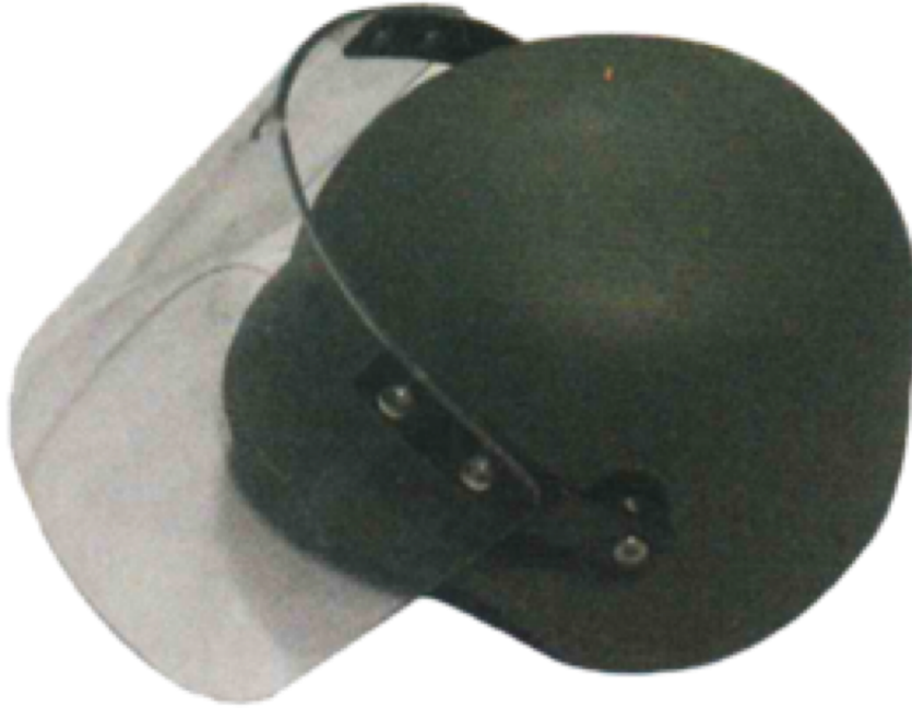
MODEL : BULLET PROOF HELMET

Bullet proof helmet is for level III-A security. It is made from woven aramid fabric lamination to minimize the weight for comfortable wearing. It also provides protection against small fire arms, handgun upto 9mm pistol, revolver, etc. Visor is not bulletproof and is meant only to protect your eyes from impact, smoke, particles, etc.