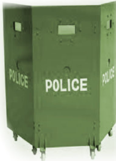
MODEL : BP MORCHA