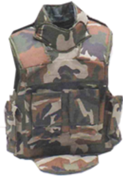
MODEL : BULLET PROOF JACKET

Our Police and law enforcement bullet proof vests are made of Kevlar along with trauma plate made of ceramic, dyneema and steel. Various sizes are available for the threat level II, IIA and IIIA, etc. The undercover bullet proof jacket/vest is elegant for everyday use and is available in various attractive designs, able to be worn daily by police, shore patrols, people in life threatening situation (politicians, business leaders, money couriers, civil police force, body guard, etc.). The style of the jacket/vest is non-military which offers high level of protection and yet is stylish.